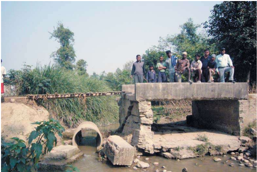
Local community standing on a bridge destroyed by flood, Singyali VDC, Mohottari District, Nepal

The maintenance of sustainable livelihoods is based on people's adaptation to environmental changes (including natural hazards) together with economic and political changes (Batterbury and Forsyth 1999). Researchers examining adaptations to natural hazards and disasters study adaptation in terms of social and power relationships also (political-economic perspective) and not only from a biological point of view (i.e., adaptation perspective) (Goodman and Leatherman 2001, p 21). Some studies focus on community adaptation to climate variability and climate change (Allen 2006; Ahmed and Chowdhury 2006; Rojas Blanco 2006; Hageback et al. 2005; Stiger et al. 2005) and multiple stresses, including natural hazards (McSweeney 2005). That said, these aspects still lack visibility in mainstream literature (Flint and Luloff 2005) and are neglected in practice, reflecting the compartmentalisation of science and the difficulty of overcoming it; and this is also reflected in government and donor budgets and the challenges surrounding (real) inter- and cross-disciplinary studies.