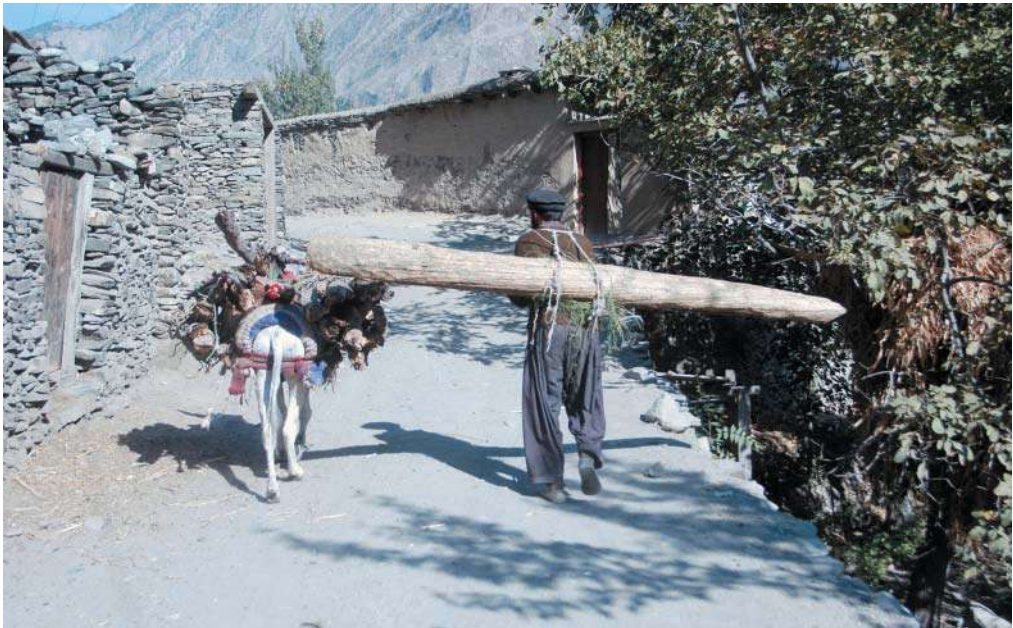
Man carrying wooden log, towards Kalash Village, Lower Chitral. Local knowledge of appropriate building styles can also contribute to disaster preparedness.