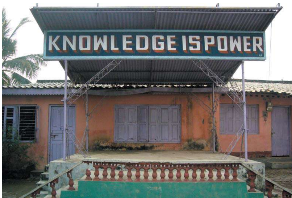
Malangawa, Sarlahi District, Nepal

The renewed interest in local knowledge does not mean that outside economic interests in benefiting from local knowledge have disappeared, as demonstrated by controversies about intellectual property rights over medicinal plants and pharmaceutical commercialisation. These aspects illustrate how the use of local knowledge raises complex issues.